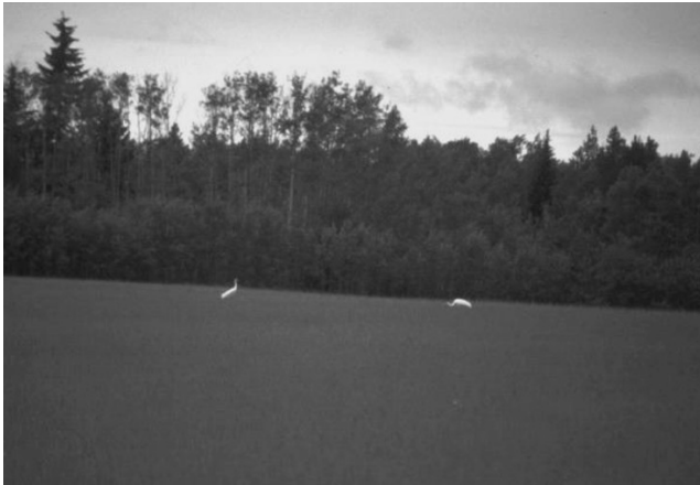
Figure 2. Two Whooping Cranes near Prince George, B.C. on 2003 June 30.

On August 26, the birds were observed and photographed by Elsie, Glen and Jerry Stanley (Figure 3). The Stanleys identified the smaller crane as an adult Sandhill Crane.