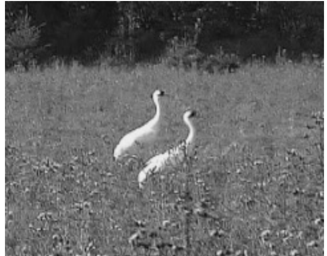
Figure 3. Two Whooping Cranes near McBride, B.C. on 2003 August 26.

The winter 2007/08 population of Whooping Cranes from WBNP stands at 266 birds. The flock is growing at a rate of 4.7% per year. To date all known nests of the cranes from the WBNP flock have been within 55 km of their natal territory (Johns et al. 2005). With this in mind it is unlikely that this species will be breeding far from their traditional nesting grounds in WBNP in the near future. As the population grows it is likely that more Whooping Cranes will con-